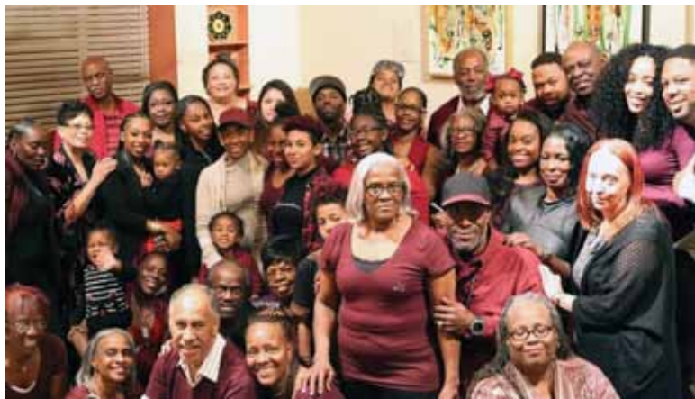
A large family Thanksgiving