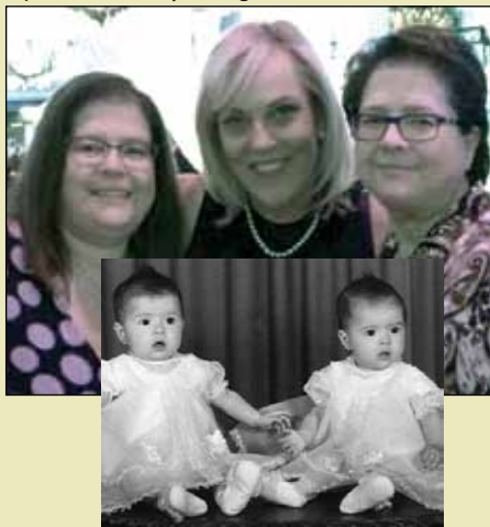
To this day no one has agreed to who is who in this photo.