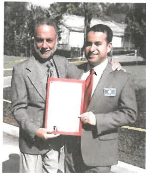
Scene from March 22 Membership Meeting