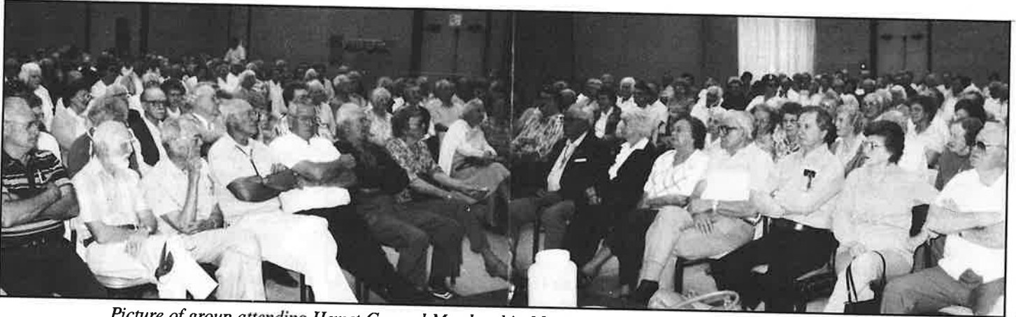
Picture of group attending Hemet General Membership Meeting in Hemet, Thursday, February 23, 1989

Free parking available on Flower Street under Santa Monica Freeway, Parking Lot "B". Look for RELAC sign. Those using this parking area, please place a RELAC decal or some RELAC identification on your dash. Remember: You must show your RELAC card to win the drawing.