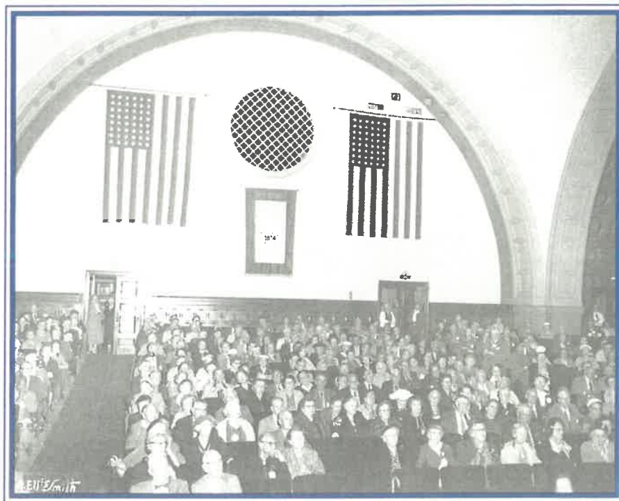
Participants in RELAC's founding at Patriotic Hall on February 5, 1958.

You can also help celebrate in Las Vegas..... Details p. 7