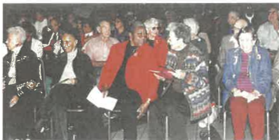
The crowd enjoying RELAC's annual Holiday Entertainment at St. Sophia's Cathedral