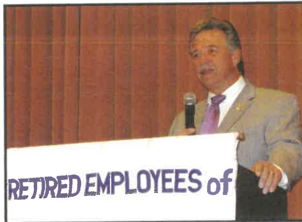
Rancho Cucamonga Mayor Donald Kurth welcomes members to RELAC's Regional Meeting.