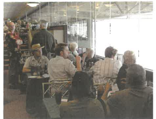
RELAC members and guests enjoying a great view of the races at Santa Anita.

May all of you have a very happy and healthy New Year.