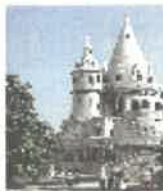
Fisherman's bastion, Budapest, Hungary