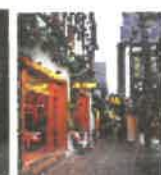
Drosselgasse Street, Rudesheim