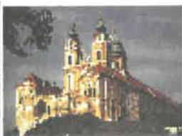
Melk Benedictine Abbey