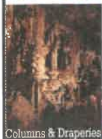
Columns & Draperies