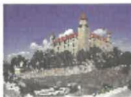
Bratislava Castle, Slovakia