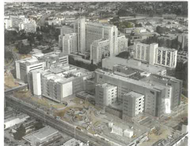
Behind the new streamlined, cutting edge Los Angeles County-USC Medical Center can be seen the 1933 County General Hospital. Another view of the Medical Center appears on p. 15.

The new facility has been built very close to the old. It consists of three linked buildings, united by a corridor, gardens and a central amphitheater. The buildings are the Outpatient Building, the Emergency Services Building, and the In-patient Building. The facility will provide 600 patient beds. Nearly all in-patients will now be housed in private rooms rather than in wards, providing both greater privacy and a quiet environment conducive to more rapid recoveries.