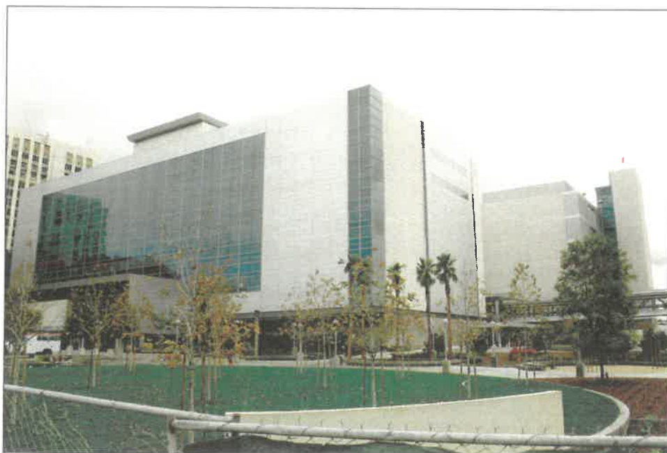
A view of the new, soon to open, Los Angeles County - USC Medical Center