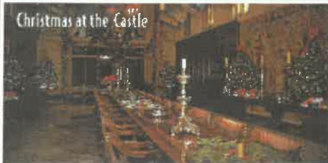
Christmas at the Castle