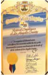
L.A. County scroll to RELAC

U.S. Department of Education. It reflects RELAC's ongoing commitment to supporting educational advancement and fostering community engagement. Festivities also will include acknowledgment of RELAC's fundraising campaigns on behalf of the March of Dimes March for Babies and the Los Angeles Regional Food Bank. The 2026 Ambassador Family of the March of Dimes will attend and speak at the event.