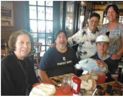
RELAC members socialize at luncheon.

We had a nice turnout for the March 12 gathering of our camping group. More than 20 RELAC members, who participate regularly in the quarterly luncheons and guests, attended the March 12 gathering at Lucille's Smokehouse in Long Beach, California.