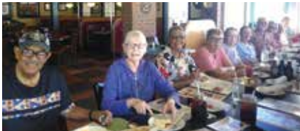
The barbecue entree was a hit at RELAC luncheon.