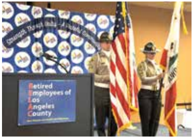
LASD Honor Guard presents the colors at 2025 Recognition Luncheon.

RELAC will present its annual Recognition Luncheon on Thursday, June 4, 2026, beginning at 11 a.m. at the Brookside Golf Course in Pasadena, California.