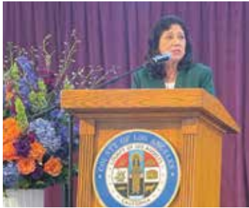
Supervisor Hilda Solis