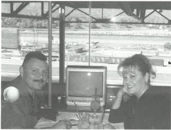
RELAC people enjoying lunch at Hollywood Park, with great view of the track

I have to be honest folks and tell you that I was a bit concerned about a decline in attendance at our 5 th RELAC Day at Races at Hollywood Park this year...mainly due to high gasoline prices and last year's reduced attendance from previous year. But, I was totally but pleasantly surprised to see a new attendance record set on June 21, 2006. A boisterous, enthusiastic and hungry crowd of 154 RELAC members and their friends showed up for a fun filled day. And we ate and ate till we could eat no more! So many came for the first time and they promised to return next year. As in the past years, folks came from