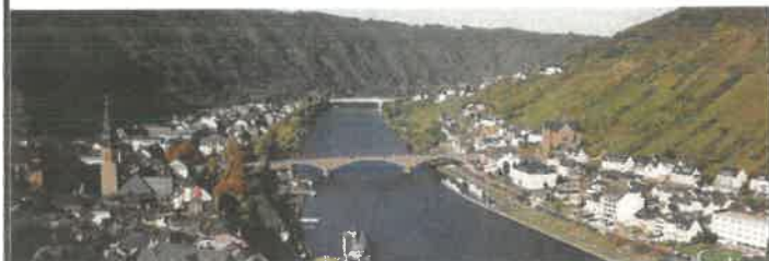
Cochern and the Mosel River