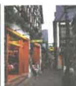
Drosselgasse Street, Rudesheim